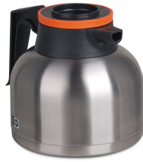
CARAFE, SST 1.9L SHRT ORN 12/