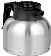
CARAFE, SST 1.9L SHRT BLK 12/