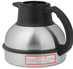
THERMAL CARAFE, ORN 1.9L 12PK