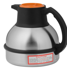
THERMAL CARAFE, ORN 1.9L 1PK