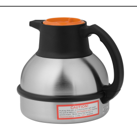
THERMAL CARAFE, ORN 1.9L 1PK