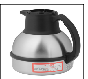
THERMAL CARAFE, ORN 1.9L 12PK