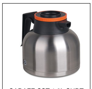
CARAFE, SST 1.9L SHRT ORN 1/