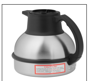
THERMAL CARAFE, BLK 1.9L 1PK