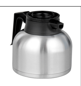
CARAFE,SST 1.9L SHRT BLK 12/