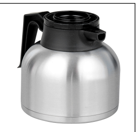
CARAFE, SST 1.9L SHRT BLK 1/